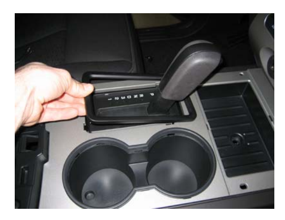
CAREFULLY remove trim from around gear shifter